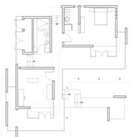
west villa floor plan