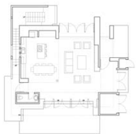
main villa floor plan