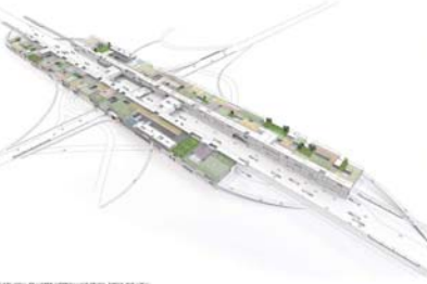
METROLINK TRANSFER INTERCHANGE STATION BRIDGE VIEW