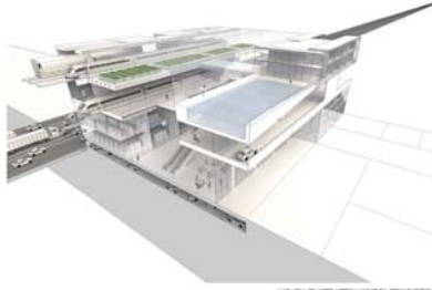
METROLINK TRANSFER INTERCHANGE STATION PRESENT SECTION (BY CONSIDERING CONSTRUCTION OF BRIDGE AND HIGHWAY)