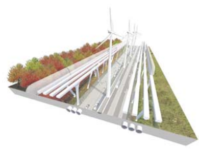
MAKING COOPERATIVE NETWORK