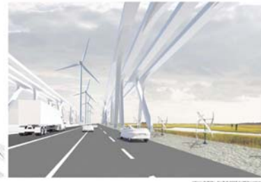
TRUCK OPTION ON THE METROLINK HIGHWAY