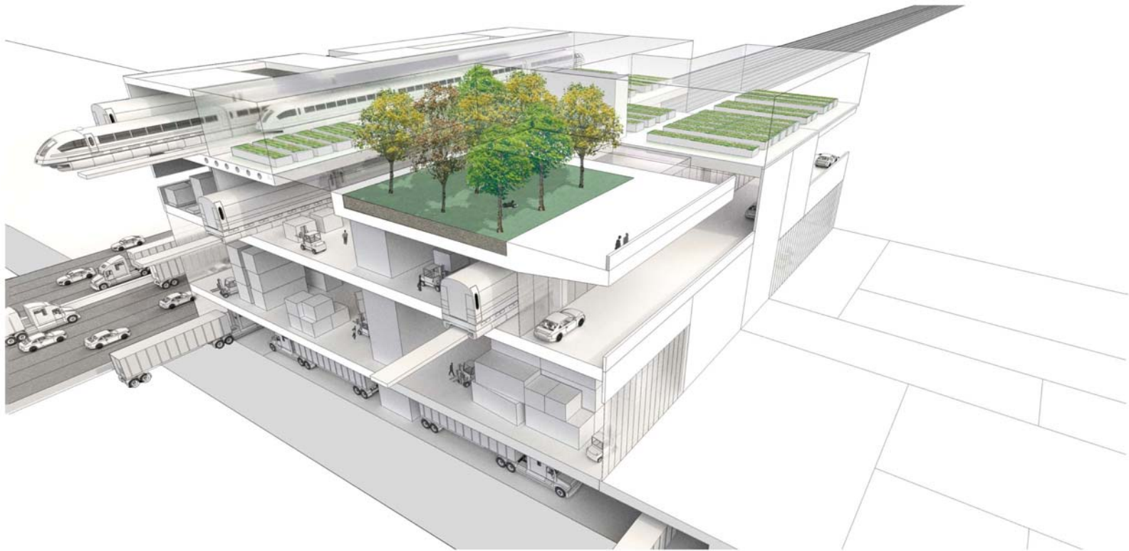
THE METROLINK TRANSFER INTERCHANGE STATION TRANSIT SECTION