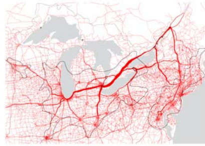
TRUCK FLOW VOLUMES IN THE GREAT LAKES METROAREA BASED ON 2007 OF TRANSPORTATION PLANNING COMMISSION DATA